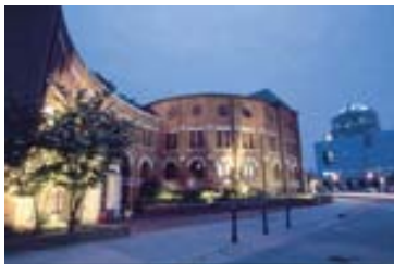
Greensboro Historical Museum

As we experience January's thaw, there's a resting taking place. New life is forming and the anticipation of spring's warmth will soon show forth its beauty. This is also the time of year to prepare and anticipate new opportunities in education as we hold our annual spring conference in Greensboro.