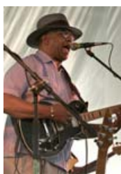
Piedmont Jazz & Blues Festival

One of the most important qualities I have had to learn is how to remain steady and balanced when often the lives of so many around me are unsteady and off balance. Being rooted in my faith, seeing the example of others around me, and being open to the ways in which I am being changed through my experience as a CPE student are all ways in which I am able to remain firm and grounded. However, after an intense night of being on-call, I must admit that I have longed for the regular routine of teaching or working in an office as I did in years past. Yet, when I am able to help another individual make a deeply spiritual connection in the midst of chaos I know and believe that I have been called to the often-hectic world of chaplaincy.