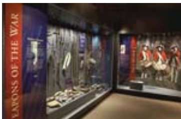
Guilford Courthouse National Military Park

We welcome new members who have been approved for membership at the Executive Council meetings in October 2005 and January 2006! They are: