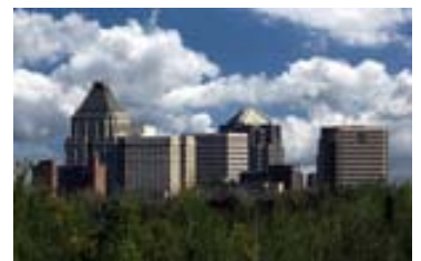
Greensboro Skyline (Day)

“To catch the reader's attention, place an interesting sentence or quote from the story here.”