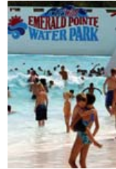
Wet'n'Wild Emerald Pointe

“To catch the reader's attention, place an interesting sentence or quote from the story here.”