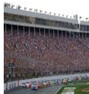
Lowe's Motor Speedway