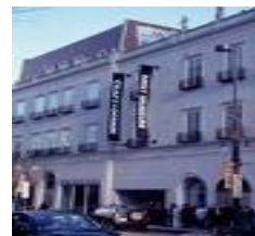
Mint Museum of Craft Design