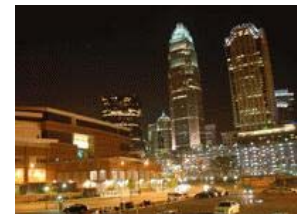
Charlotte Night Skyline

Our annual conference will be held April 28-May 2. The title for this year's conference is Discovering Sacred Horizons: Encounters that Enrich . The goal of the conference is to provide opportunities for professional growth, skill enhancement, and greater definition of our profession in the collaboration with other disciplines. In addition the conference is designed to equip us as leaders in complex and diverse environments, help us find time to relax, renew, and reconnect with ourselves and others and stretch beyond familiar traditions through education, excursions, and encounters. I was pleased that this year's conference gives us opportunity to choose between four educational excursions to cultural and religious sites for CCE credit. Kinda like a field trip for credit.