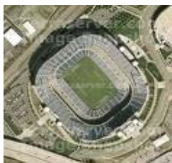
Bank of America Stadium