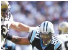
Charlotte Panthers

Welcome North Carolina Chaplains to the Spring 2007 Conference and to Charlotte, NC. This is the first time, at least as far as I know, for the NCCA to be in Charlotte. The conference will be held at the Sheraton Charlotte Airport, directly off I-85 and Billy Graham Parkway. This newly renovated hotel has a very nice selection of amenities, such as indoor & outdoor pool, exercise room, whirlpool & sauna, data ports in guest rooms plus wireless internet in common areas, and Sheraton Sweet Sleeper Beds – I feel myself relaxing already. It is conveniently located so that you can easily travel to the many attractions Charlotte has to offer.